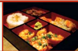
Bento C Teriyaki Shrimp $9.00