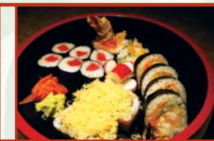
Maki B Shrimp Tempura, Tuna & Crunch Roll $10.00