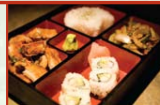
Bento D Ton Katsu $10.00