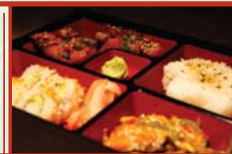
Bento A Teriyaki Chicken $8.00

4 pc. California Roll, Stir Fried Vegetable & Steamed Rice, Substitute Fried Rice $2