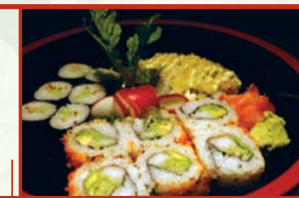
Maki A California, Cucumber & Crunch Roll $9.00