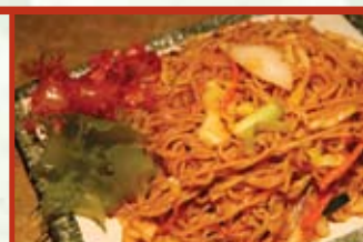
Yaki Soba Stir Fried Egg Noodle with Vegetable $8.00