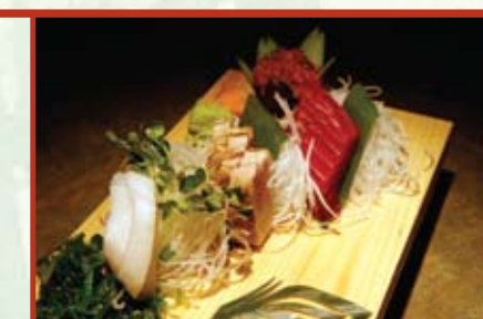
Tuna Sashimi 3 pcs. Red, 3 pcs. Seared, 2 pcs. White $12