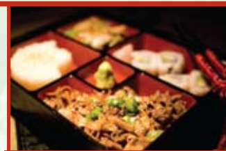
Bento B Teriyaki Beef $9.00