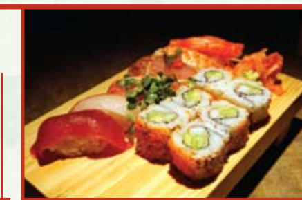
Sushi B 6 pcs. Sushi & California Roll $11.00