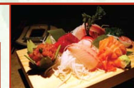
Combination 2 pcs. each, Tuna, Salmon, Whitefish & Yellow Tail $12

Substitutions subject to additional charge (Parties of six or more will be charged 18% gratuity)