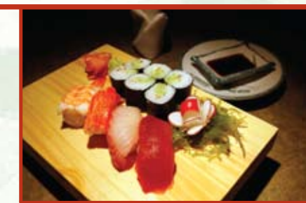
Sushi A 4 pcs. Sushi & Cucumber Roll $9.00