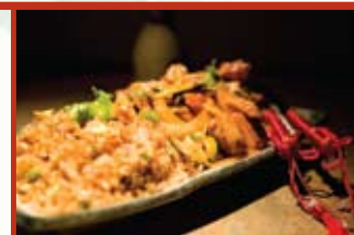
Spicy Chicken with Fried Rice $8.50