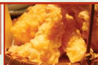
Shrimp Tempura 6 pcs. $9.00