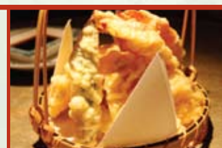
Shrimp & Veggie $8.00