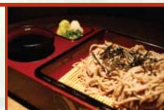
Soba Cold Buckwheat Noodle $8.00